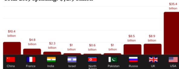
Total 2019 spending: $72.9 billion

This year marked the 75 th anniversary of the U.S. bombings of Japan with nuclear weapons, an attack that killed close to a quarter million people by the end of 1945. Remembrance is inseparable from recognition that nuclear weapons are not yet history. They are still here . The threat of nuclear war is real and growing. As of April 2020, there were approximately 13,410 nuclear weapons in the world held by 9 countries. In 2019, these 9 countries spent $72.9 billion dollars on nuclear weapons, more than $138,000 a hour. These costs are primarily based on the cost of warheads and delivery systems and development alone to permit comparison across nations. Other estimates that include verifiable costs of all nuclear programs that would not be spent if nuclear weapons did not exist, calculate the true costs of nuclear weapons in 2020 in the U.S. alone to be on the order of $67.595 billion .